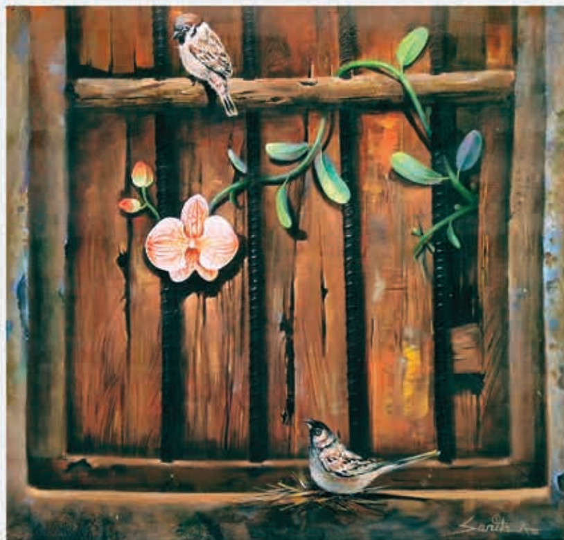
Struggle for Existence

Medium: Acrylics on Canvas Size: 24x24 inches