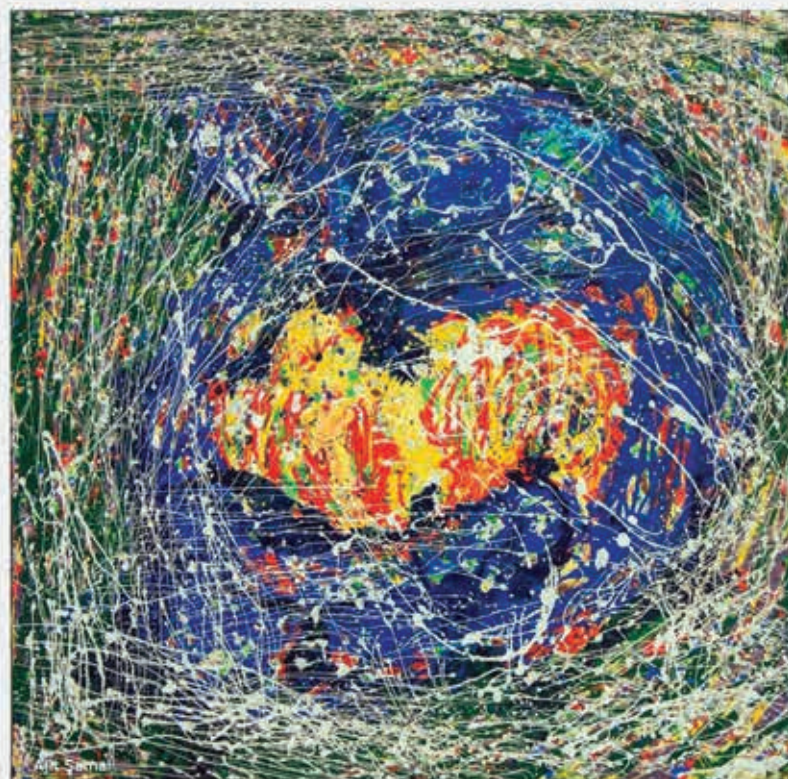
Mother and Child Medium: Mixed Media Size: 36x36 inches