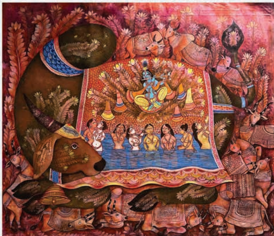
Old Heritage - 17 Medium: Acrylic on Canvas Size: 38x42 inches