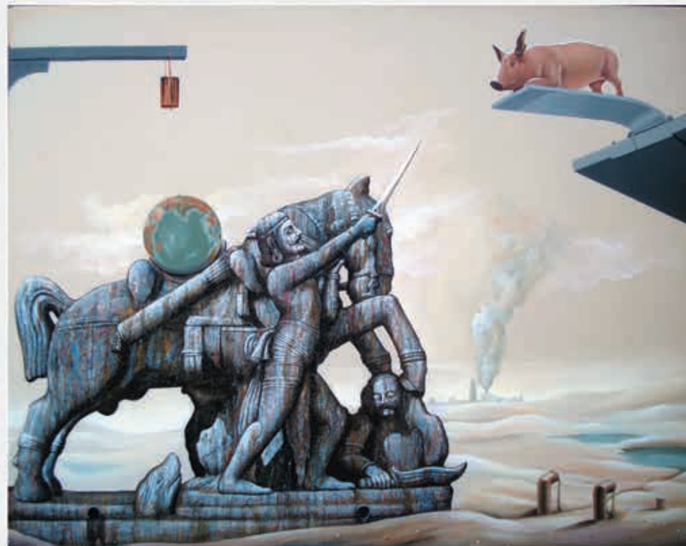
Protector Acrylic on Canvas Size: 60x48 inches