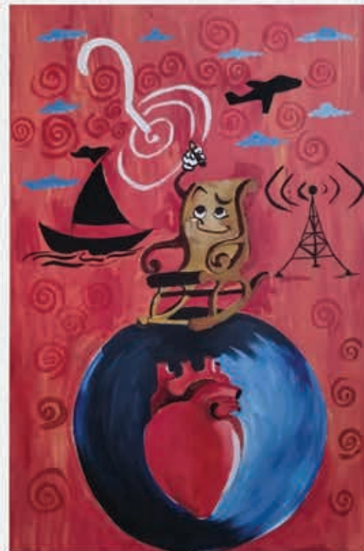
Untitled Medium: Mixed Media Size: 36 x 48 inches