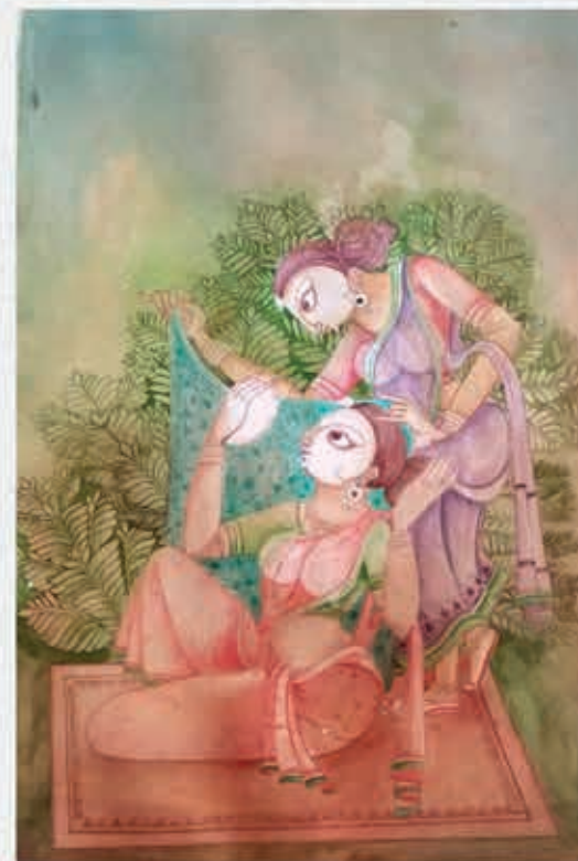
Sakhi Medium: Wash Painting Size: 18x 24 inches