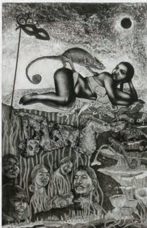
The Changing Shades