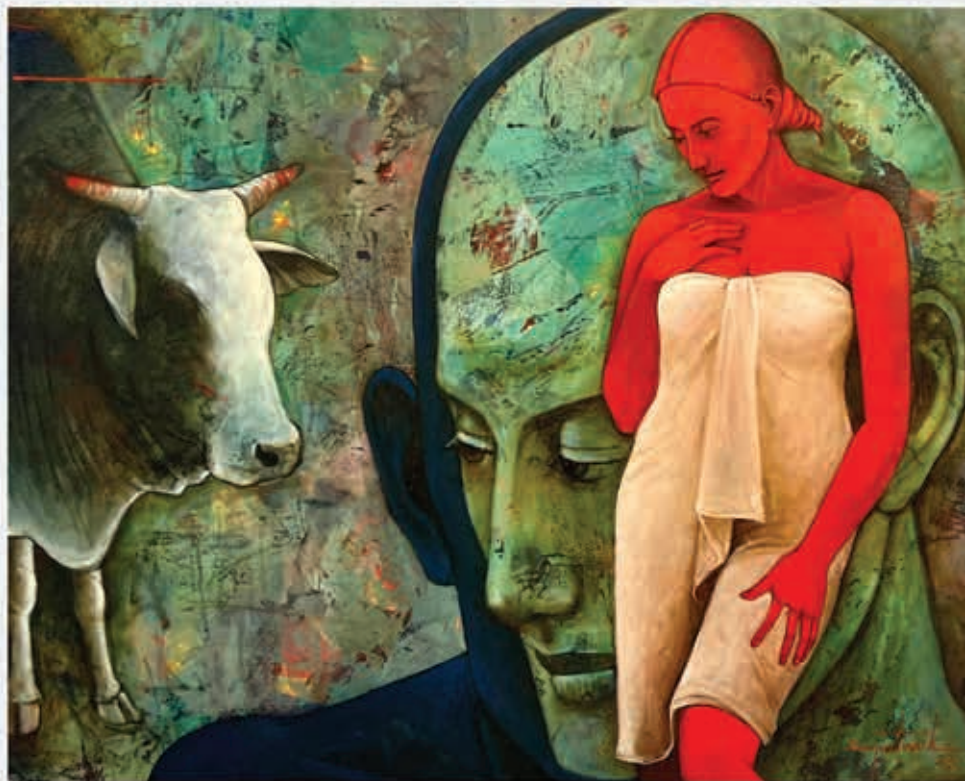
Passionate Certitude Medium: Acrylic and Oil on Canvas Size: 34x42 inches