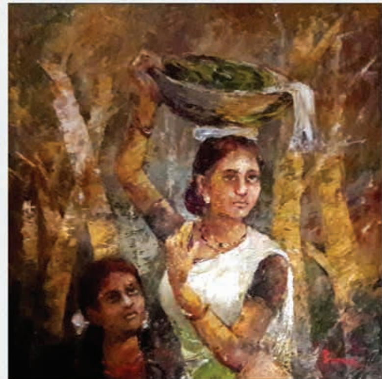
Life in Wood

Medium: Acrylic on Canvas Size: 24x24 inches