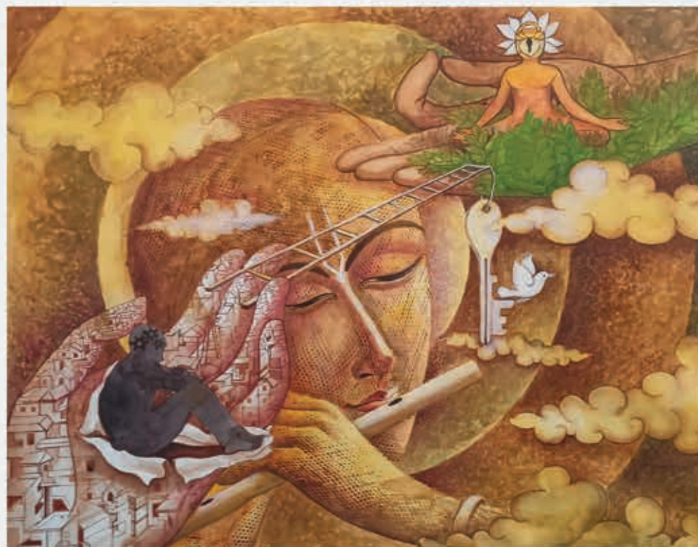
Urban Spiritual Waves Medium: Mixed Media Size: 36x28 inches