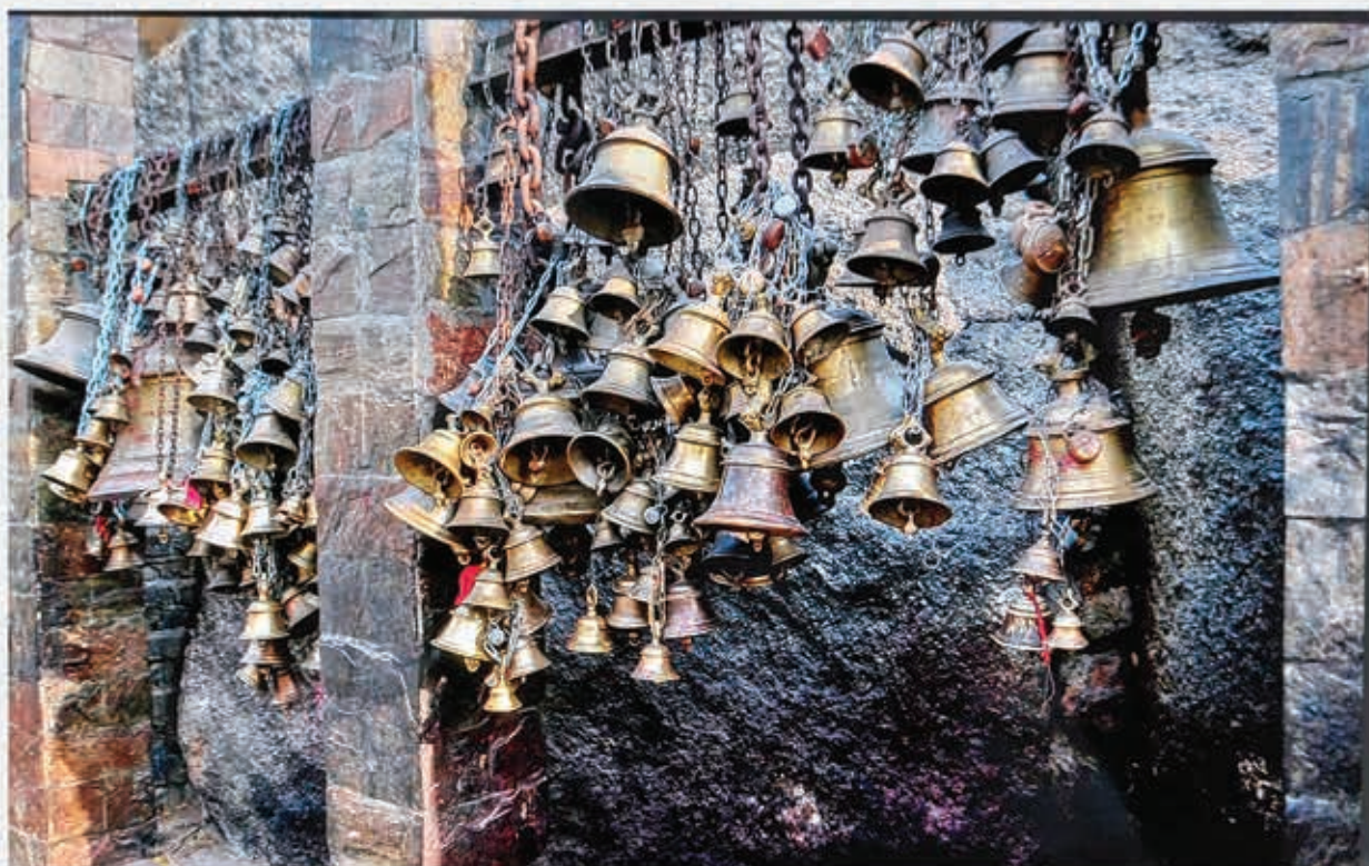
Untitled Medium: Photographs- Printed on Canvas Size: 24x34 inches