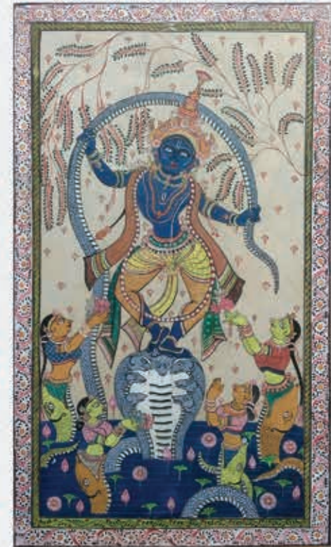
Kaliya Dalana Medium: Tempera Size: 22x 15 inches