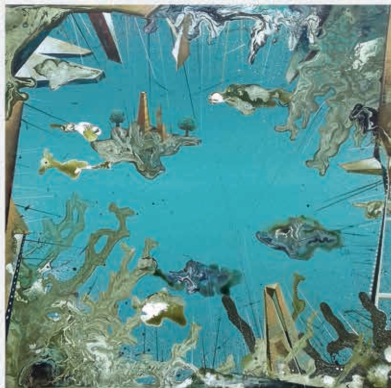
Our Landscape -1 Medium: Acrylic on Canvas Size: 24x24 inches