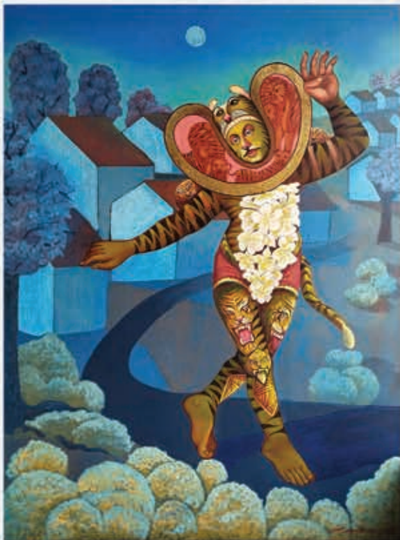
Immortal Culture 2 Medium: Mixed Media Size: 36 x 48 inches