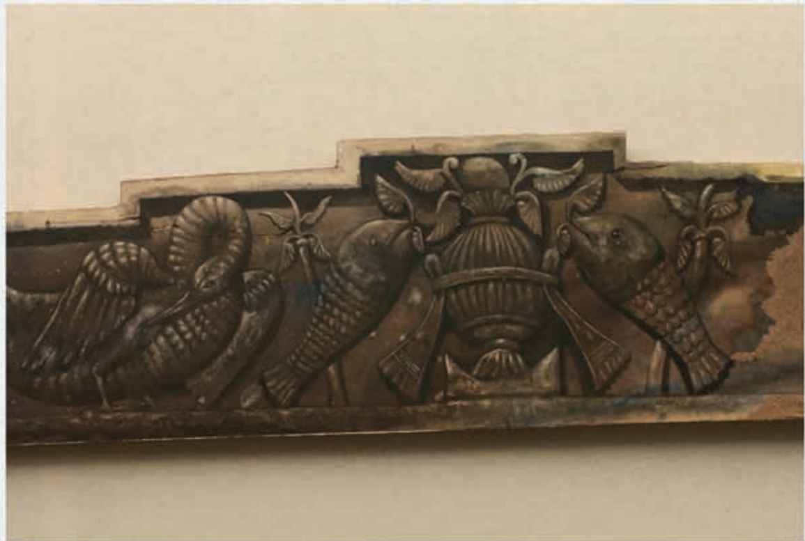
Transformation in Matter-II

Medium: Watercolour on Paper Size: 18x54 inches