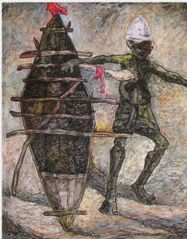
Lone Hope Medium: Mixed Media Size: 36x32 inches