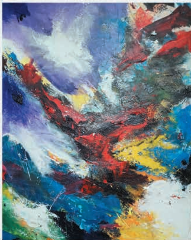
The Music of Colors

Medium: Acrylic on Canvas Size: 18x24 inches