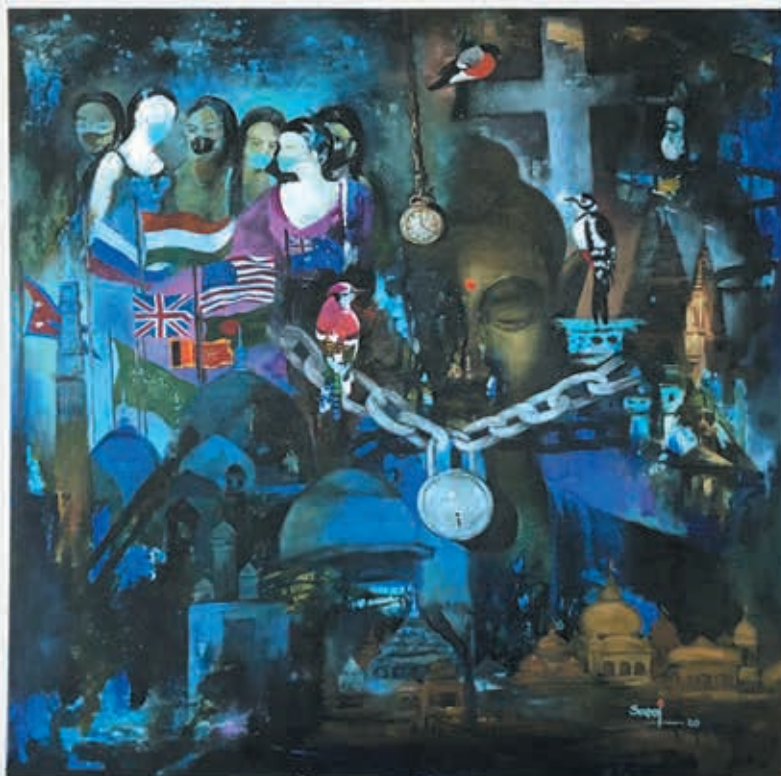
Untitled Medium: Mixmedia Size – 24x24 inches