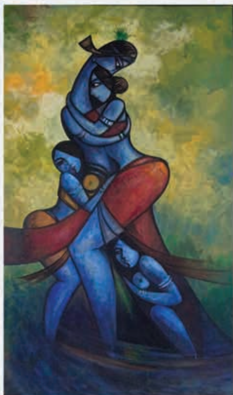
Untitled Medium: Acrylic on Canvas Size: 40x50 inches