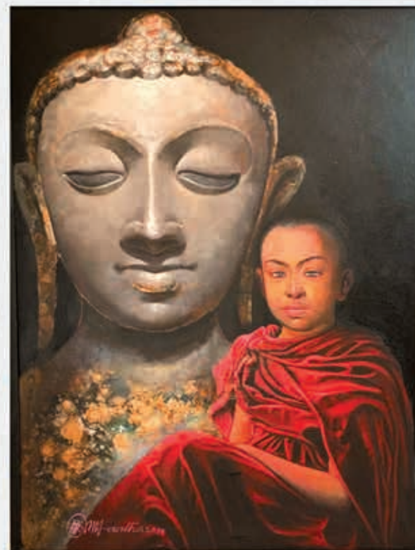
The Young Monk

Medium: Oil on Canvas Size – 36x48 inches