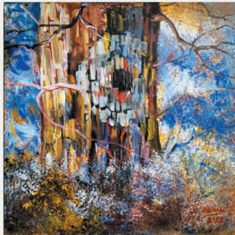
God in Nature Medium: Acrylic on Canvas Size - 24x24 inches