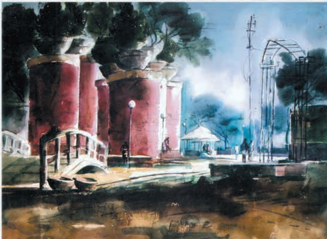
Morning Spot Medium: Watercolour on Paper Size: 22x30 inches